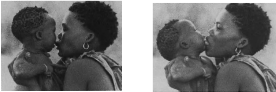
Figure 5.7. A !Ko-woman of the Bushmen of the Central Kalahari Desert comforts her little sister by kissfeeding. (From a 16-mm film taken by I. Eibl-Eibesfeldt.)