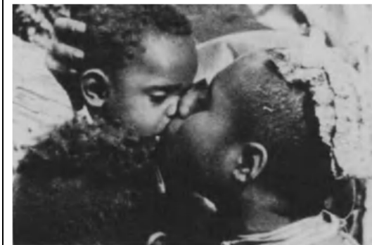
Fig. 5.10. Eipo adult female of West New Guinea kisses a baby.