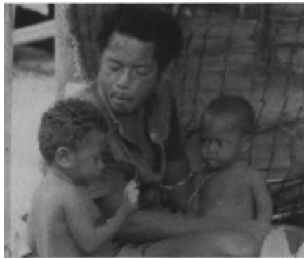
Fig 5.6 – 5.10